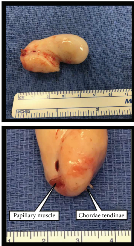
FIGURE 3: Surgical specimen consisting of a 12-gram pink-tan rubbery mass that is 4.7 \times 2.6 \times 2.1 cm. A scant amount of red-tan, shaggy adherent tissue is present on one edge representing the papillary muscle penetrated by the tumor. The sacrificed chordae tendinae traversing the lesion can also be seen on the other edge.