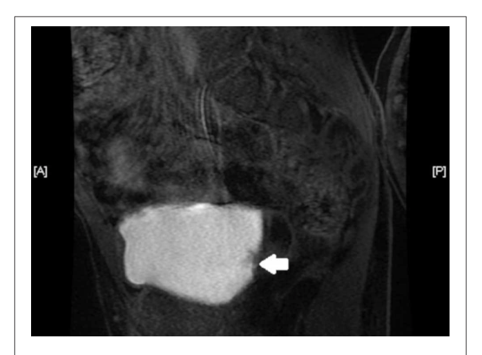
FIGURE 1 | Abdominal MRI, in axial section, showing the lesion (indicated by the white arrow) restricted to the bladder mucosa, close to the right ureteral ostium.

On follow-up, ultrasound was performed every 3 months and cystoscopy every 6 months. Two and a half years after the resection, the patient is cancer free.