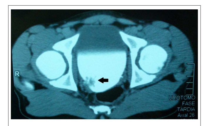
FIGURE 2 | Abdominal CT scan, in axial section, showing the lesion (indicated by the black arrow) in the right posterolateral bladder wall.