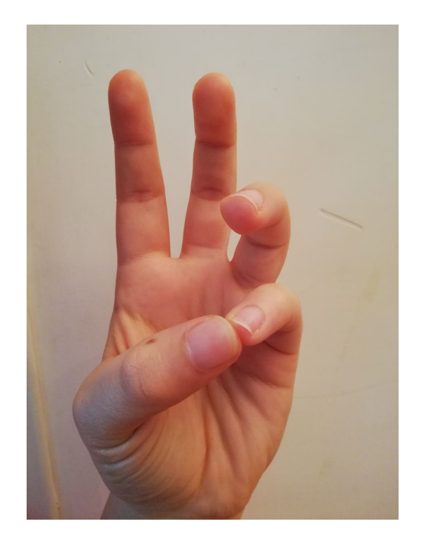
FIGURE 2 The first finger position of the BWM

The BWM technique used in the experimental group involves an easy-to-implement 4-step finger movement procedure (see Appendix 1). Through the four positions, the physiology of our mind-body asset changes, gradually creating an activation of the parasympathetic system. The hemispherical dominance from left to right changes as well, which, in turn, automatically generates lowered pulse rate, lowered breathing rate, and muscle relaxation (Cozzolino