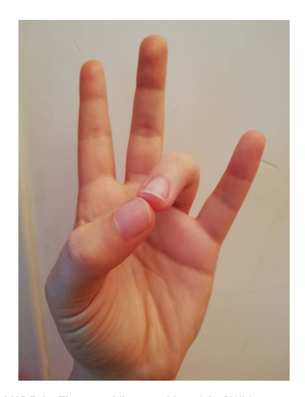
FIGURE 3 The second finger position of the BWM

& Celia, 2016; Hirai, 1975). In the first step already (Figure 2), the BWM naturally helps our brain to release slower alpha waves (Desai et al., 2015), characterized by a relaxed wakefulness that becomes even slower during the second step (Figure 3). In the third step (Figure 4), the technique produces typical sleep waves such as theta waves (Lagopoulos et al., 2009). Then, in the fourth step (Figure 5), the brain starts to produce delta waves, that is., the very deepest