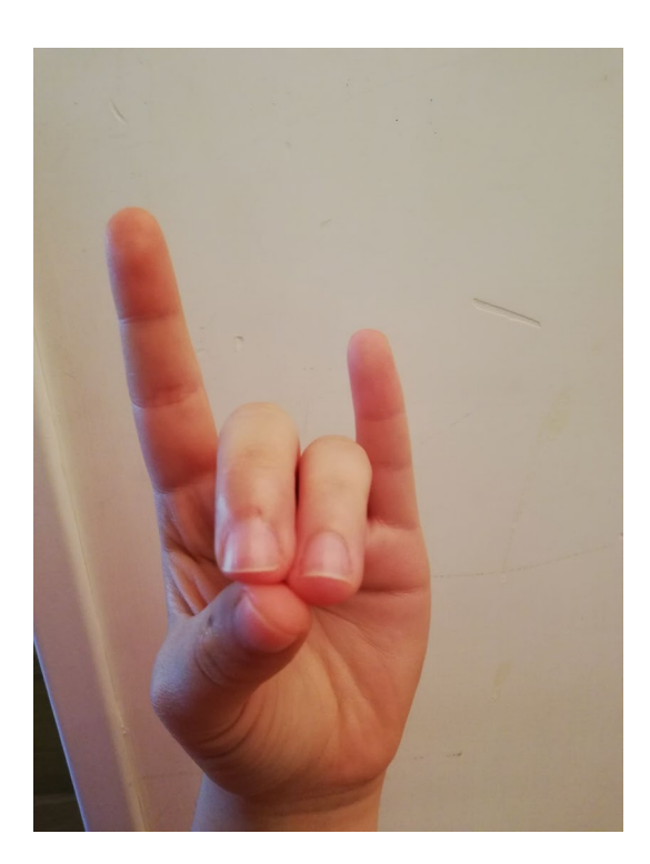
FIGURE 5 The fourth and last finger position of the BWM

level of sleep and mental relaxation (Hondrou & Caridakis, 2012). Through these four steps, fast and intensive waves are replaced by slower and larger waves that are typical of relaxation and deep sleep (Cozzolino & Celia, 2016).