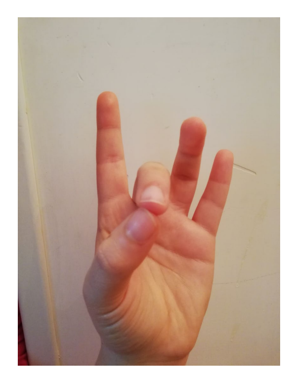
FIGURE 4 The third finger position of the BWM