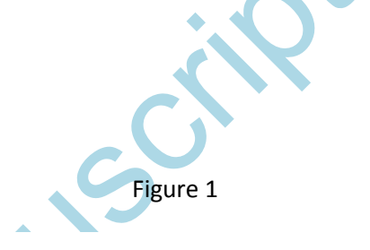
Projected Length of Burn Surgery Cases