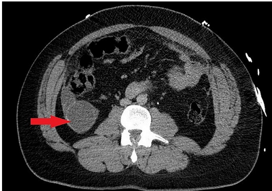
FIGURE 1: CT demonstrating 5.6 x 4.9 centimeter mass at the tip of the appendix.

The patient was hemodynamically stable and was taken from the trauma bay to the radiology suite for angioembolization of the proximal splenic artery. Post-procedure, he was admitted to the Intensive Care Unit (ICU) for serial hemoglobin and cardiac monitoring. His hemoglobin trended down slightly from 12.1 to 9.9 g/dL over the course of three days. During this period, a discussion was held with the patient and family by the trauma team regarding his incidental appendiceal lesion - imaging characteristics were consistent with a mucinous neoplasm, though, without a tissue diagnosis, the malignant potential was unknown. He denied having any symptoms prior to admission, any family history of cancer, or ever having a colonoscopy.