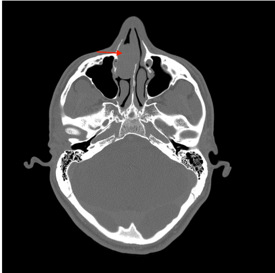
FIGURE 1: Axial soft tissue contrast-enhanced computed tomography scan of the paranasal sinuses and orbit