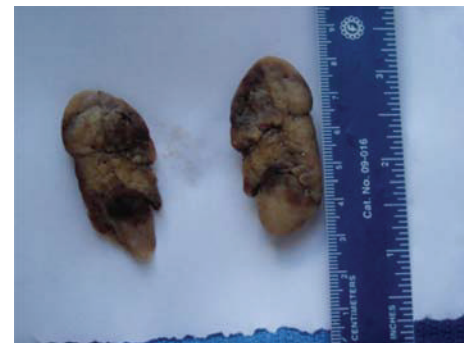
FIGURE 5: Gross specimen of a bisected parathyroid adenoma.