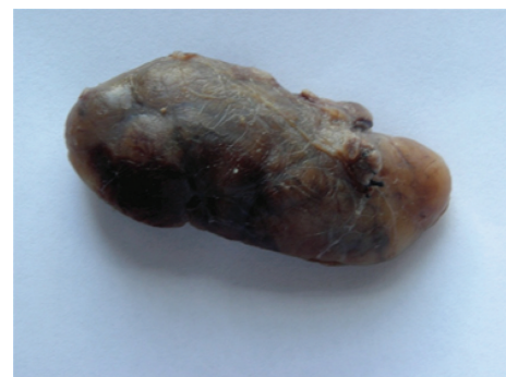
FIGURE 4: A gross specimen of one the parathyroid adenomas (whole).