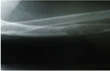
FIGURE 1: Lateral X-ray of the right radioulna showing osteitis fibrosa cystica lesion of ulna diaphysis with a pathologic fracture (before curettage).