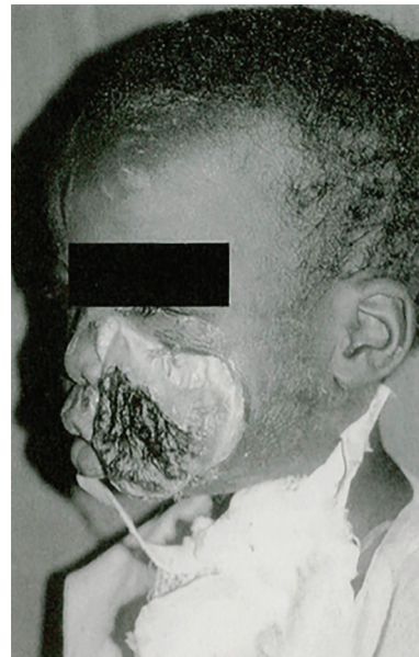
Fig. 4: African child with noma of the left cheek (32).

Plastic surgical services are recognized as relatively low-cost means of alleviating or resolving the immense suffering from these disabling conditions. 7,33 Developing countries frequently lack resources devoted to plastic surgery to meet the demand. 10 In China or India, there are less than one tenth of the plastic surgeons per million people as in North America (~1.5 vs ~6 surgeons per million). 8 Countries in Sub-Saharan Africa have less and in some cases