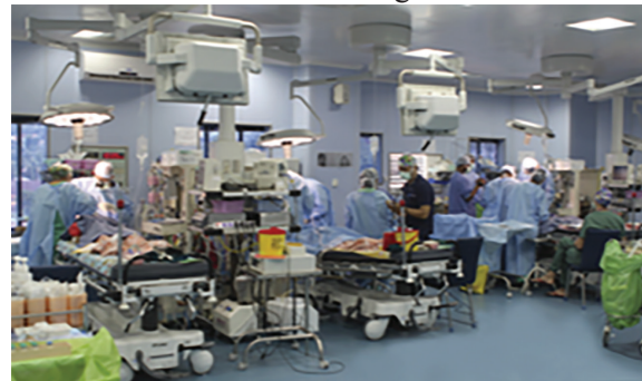
Fig. 7: The operating suite of a state-of-the art surgical facility at a care center with an open layout, advanced surgical equipment, sophisticated anesthesia and monitoring capabilities (30).

In humanitarian plastic surgical initiatives there has been a shift from supporting missions to building care centers, which prioritize sustainability and build quantity, capacity and availability of the local health care systems through education or financial support. 29,30 Developing healthcare infrastructure involves empowering medical staff, improving education and training of in-country personnel and construction of new units, such as cleft centers 51 (Figure 7). Supporting local surgeons in their care for their indigent patients is the most cost-effective method of increasing access to care. 35