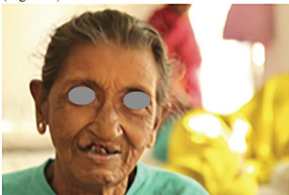
Fig. 3: Elderly Indian lady with untreated cleft lip (30).

Lack of knowledge relating to CLP augments the problem in resource-limited countries. 25 Dramatic improvement in appearance and speech can be achieved in one or two reconstructive operations, but in the developing world access to CLP care is severely limited. There is a backlog of around 4,000,000 untreated CLP patients worldwide, 26 the majority of whom live in the developing world. 8 These people live with the physical, psychological and socioeconomic consequences of clefts throughout their lives 27-29 and cause a tremendous cost to productivity 27-30 (Figure 3).