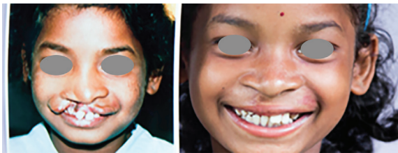
Fig. 6: Cleft lip before and after repair (20).

Surgical “mission-trips” have been one approach to address the gap in plastic surgical care and increase the availability of plastic surgical care in LMIC. Missions are short-term humanitarian operations where human resources, expertise and supplies are delivered by a team of volunteer surgeons and medical personnel into areas of the world with limited access to specialized medicine. 39-41 Humanitarian organizations have organized outreach programs for decades, and today hundreds of reconstructive and plastic surgery missions are conducted in the developing world providing surgeries for craniofacial deformities, congenital defects including CLP repair, burns, and trauma 42-44 (Figure 6).