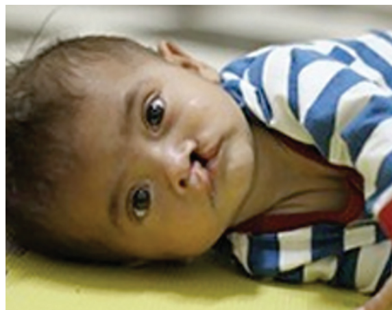
Fig. 2: Child with cleft lip (20).

Congenital anomalies account for an estimated 9% of the burden of surgical disease, 3 and cleft lip and palate (CLP) are amongst the commonest congenital anomalies in the world, affecting 1 in 500-1000 live births 21 (Figure 2). CLP increases perinatal mortality 22 and surviving CLP infants are at increased risk of malnutrition, infection, and speech and feeding problems. 22,23 Children with CLP may be stigmatized and ostracized from their communities, and be denied education and employment opportunities. 24 Newborns with cleft deformities have been known to be