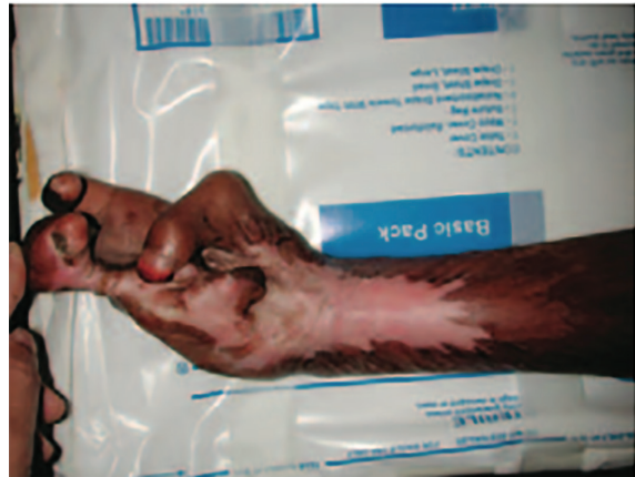
Fig. 1: Severe electrical burn-related contracture of a young girl's hand and forearm (16).

Worldwide, burns are responsible for a significant proportion of acquired deformities requiring reconstructive care. 2,16 Around 10.9 million people suffer from severe burns each year. 17 Burns are the 11th leading cause of death among children and the 5 th leading cause of non-fatal childhood injury. 18 Burns are overrepresented in the poorest parts of the world, where large open flames are often used for cooking, livewires are exposed and fires result from destructive wars. Burns can cause