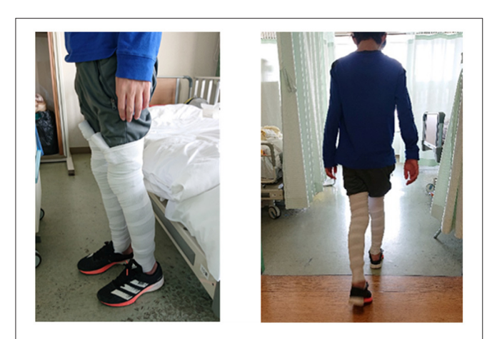
FIGURE 2 | Images of the patient in the standing position and walking with elastic bandages on both lower limbs.