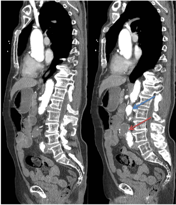
Figure 1 Saggital CT angiography demonstrating separation between the patient's known 4.6 cm saccular (red arrow), infrarenal abdominal aortic aneurysm and the eventual site of exsanguinating haemorrhage (blue arrow). Note: there is no extravasation of contrast to suggest the presence of an aortoduodenal fistula.

active bleeding. A left colectomy was performed and the patient was left in discontinuity with temporary abdominal closure due to the patient's extremis and expectation of a 'second-look' operation. The possibility of an ADF was discussed initially but in the light of the ischaemic left colon and unimpressive EGD, this diagnosis was thought to be unlikely.