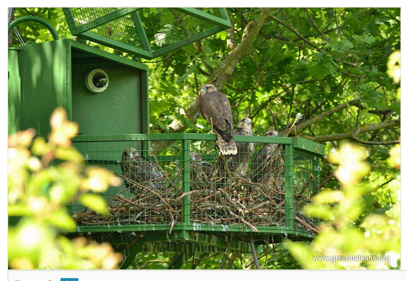
Figure 2. doi Photograph of an opened hack cage

The hacks were equipped with surveillance cameras looking in and down on the cage. Up to 90 m away, feeding tables were set up in direct view of each aviary. Following a veterinary health check, during which each Saker Falcon was equipped with a microchip and a set of identification rings, the birds were transferred from the breeding facility to the hack sites at an age coinciding with their ability to fledge - around 30 days-old. They were placed in the cages in groups of three to five and kept within them for the first 10 days to avoid risk of predation. During that period, they were monitored via the internal surveillance cameras.