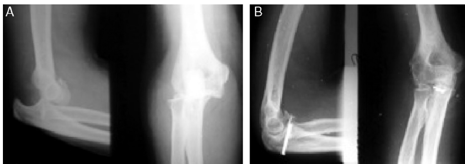
Fig. 1 – A 56-year-old woman who suffered a fall from a standing position. (A) Lateral and anteroposterior radiographs prior to reduction, showing posterior dislocation of the elbow and type 2 fracturing of the radial head, with a comminuted anterior fragment. (B) Lateral and anteroposterior radiographs after surgical treatment, showing concentric reduction of the elbow, despite resection of the anterior fragment of the radial head.

into three main types. Type 1 consists of fractures of the top of the coronoid process: 1A with fragments up to 2 mm and 1B with fragments larger than 2 mm. Type 2 fractures are antero-medial and type 3 are at the base of the coronoid process. Type 1A fractures of the coronoid process were identified in 19 patients, and type 1B fractures in the remaining seven patients.