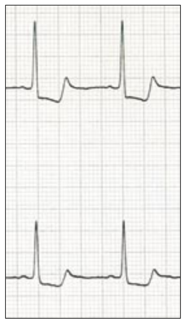
Figure 3. Down-sloping ST depression.

The final Interpretation of the ECG is positive if the ST criteria are met at any heart rate, and there are no factors to preclude appropriate interpretation of the test. The interpretation is negative if no significant ST changes are noticed. The test is nondi-