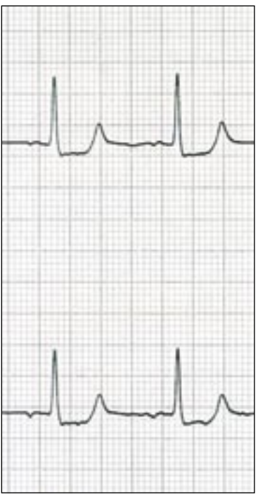
Figure 2. Horizontal ST depression.

Causes of false negative test include use of \beta -blockers, which may reduce the diagnostic or prognostic value of exercise testing because of inadequate heart rate response, but the decision to remove a patient from \beta -blocker therapy for exercise testing should be made on an individual basis and should be done carefully to avoid a potential hemodynamic "rebound" effect, which can lead to accelerated angina or hypertension.<sup>28,30</sup> Acute administration of nitrates can attenuate the angina and ST depression associated with myocardial ischemia. Atrial repolarization waves are opposite in direction to P waves and may extend into the ST segment and T wave. Exaggerated atrial repolarization waves during exercise can cause downsloping ST depression in the absence of ischemia.<sup>31,32</sup>