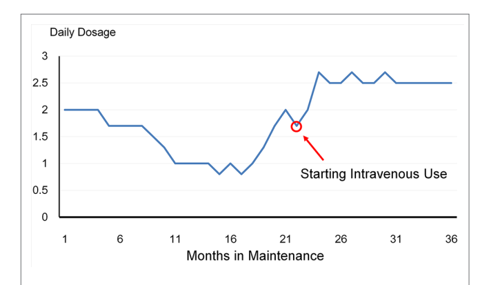
FIGURE 2 The trajectory of the patient who used buprenorphine intravenously. The dosage was reduced over a period of 16 months, and then increased gradually to 2 mg/day in the 22nd month. The patient then started using buprenorphine powder intravenously for about 14 months until his second hospitalization.

BMT, buprenorphine maintenance treatment.