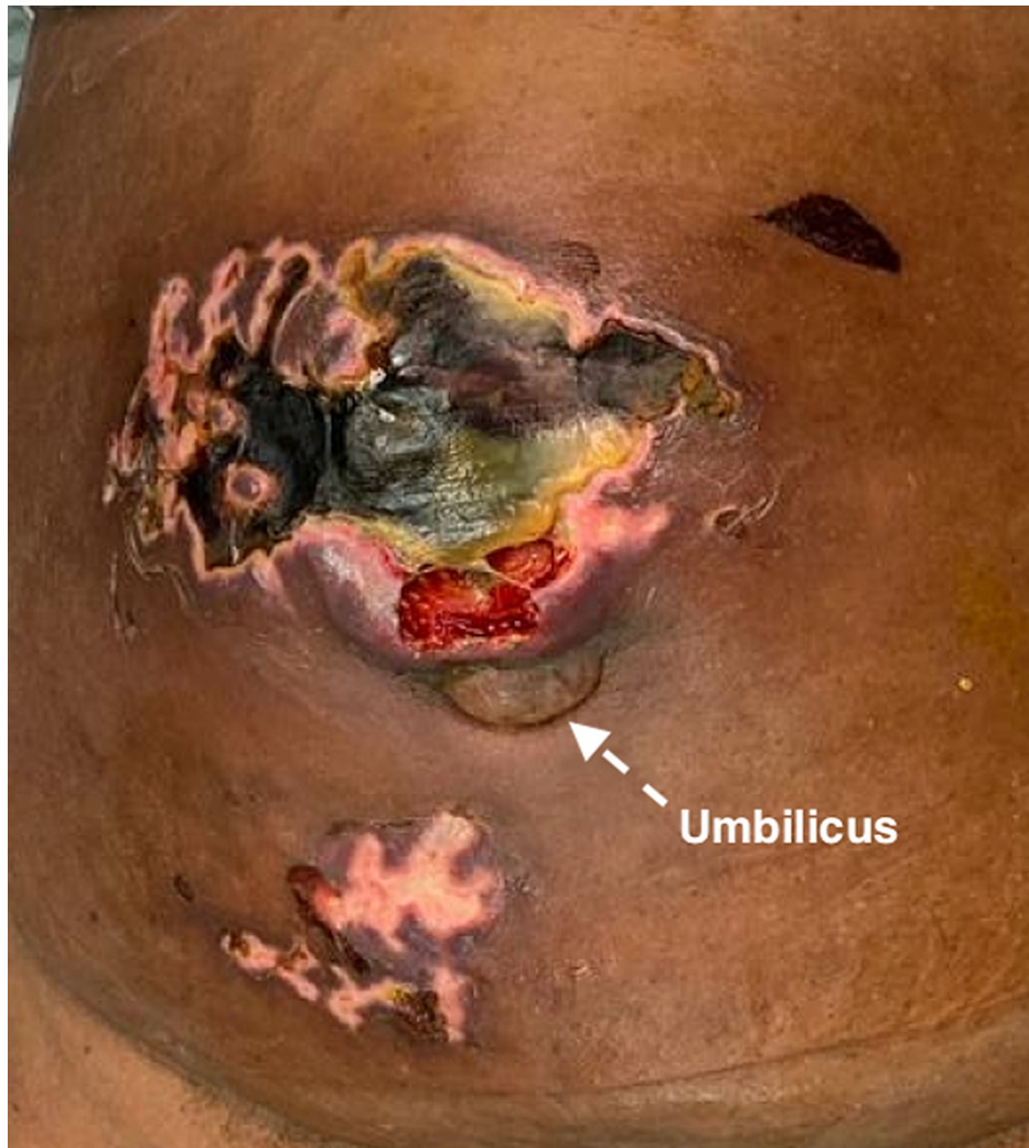
FIGURE 1: Epigastric hernia with necrotic overlying skin.