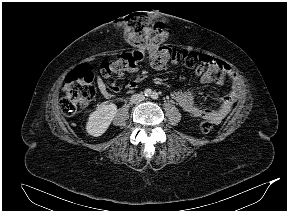
FIGURE 2: CT of the abdomen showing epigastric hernia containing transverse colon.