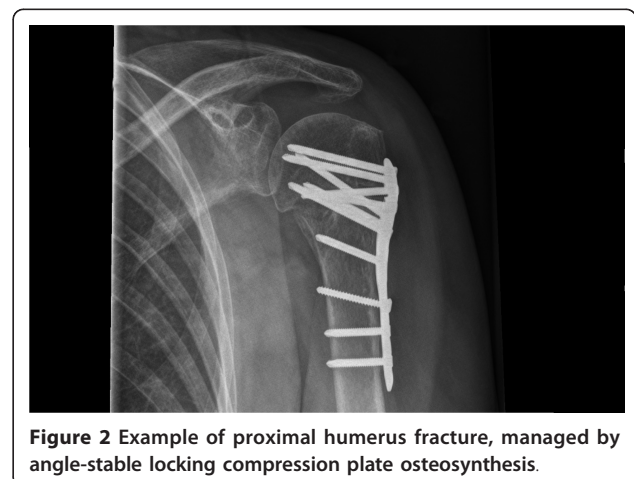
Figure 2 Example of proximal humerus fracture, managed by angle-stable locking compression plate osteosynthesis.

Fracture older than 14 days ASA IV-V Multitrauma ISS > 15 Pathological fracture Previous surgery on injured shoulder Severely deranged function caused by a previous disease "Head split" type fracture of proximal humerus Unwillingness or inability to follow instructions