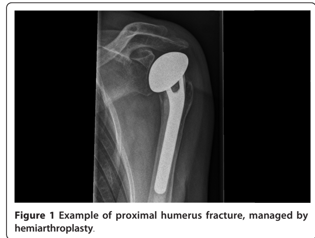
Figure 1 Example of proximal humerus fracture, managed by hemiarthroplasty.

Angle-stable locking plate osteosynthesis [Figure 2] is performed with the patient in supine or beach-chair position on a radiolucent table and a deltopectoral approach is used. The fracture is reduced and provisionally stabilized with (threaded) Kirschner wires. The reduction is confirmed as adequate with use of image intensification. The angle-stable locking compression plate is positioned with the help of a mounted aiming device, at least 5-8 mm distally of the upper end of the greater tuberosity and 2 mm posteriorly to the bicipital groove. Care is taken to ensure that a sufficient gap is maintained