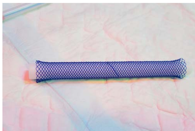
Fig. 1 A biodegradable stent consisting of polydioxanone monofilament.

Clinical success was achieved in only one of five patients (20%) and even in that individual (Case 4) the stricture did not resolve and 8 months later, EBDs were needed to avoid bowel obstruction (Table 2). The stent migrated in one patient (Case 1), who