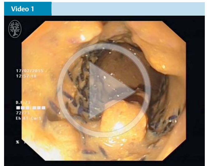
The biodegradable stent was used to treat an inflamed de novo stricture in the sigmoid colon of a patient with CD. It caused severe hypergranulation and the patient was referred to surgery. Online content including video sequences viewable at: http://dx.doi.org/10.1055/s-0042-101940

In our case series, we used biodegradable stents for treatment of both small bowel and colonic strictures with anastomotic as well as de novo origin. However, after treating six patients, the rate of clinical success was unacceptable and stent malfunction was common. Data from the initial case series using biodegradable