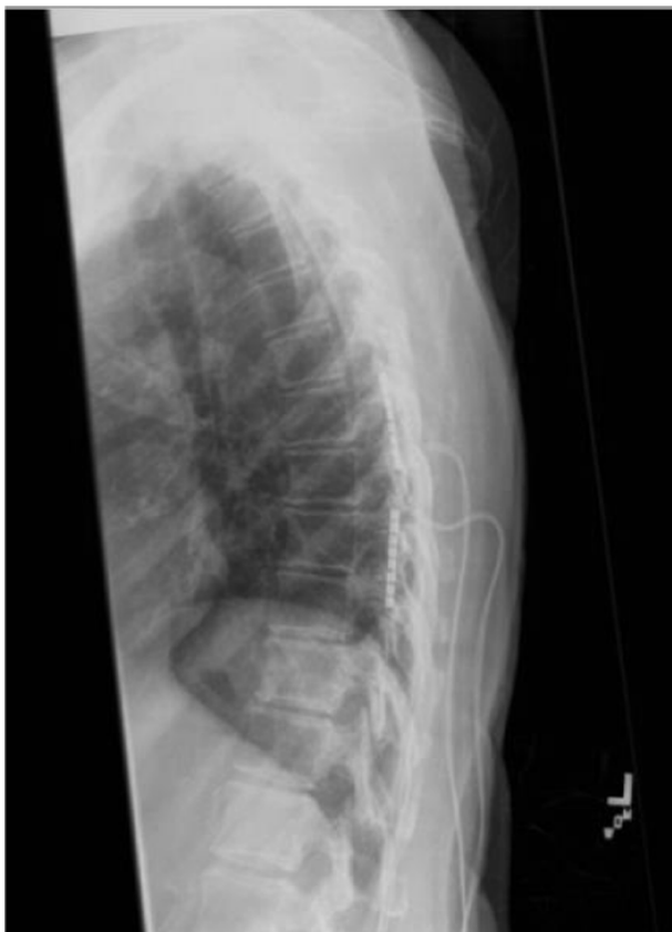
Figure 2 Lateral thoracic X-ray image showing permanent paddle lead placement in the thoracic interspaces.

Written informed consent was obtained from our patient for publication of this case report and any accompanying images. Institutional Review Board was not needed