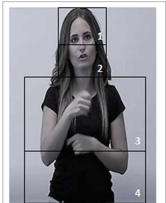
FIGURE 2 | Interest areas on the signer's body: 1 = Upper face; 2 = Lower face; 3 = Upper body; 4 = Lower body.

Next, we focused solely on the group of deaf students. Comprehension performance (percentage accuracy) was