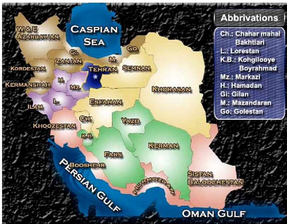
Figure 1. The map of Iran and its provinces.

whole of country as a feedback and to public health authorities and policy makers as a feed forward by SMS too. We assessed the coverage of Mobile and