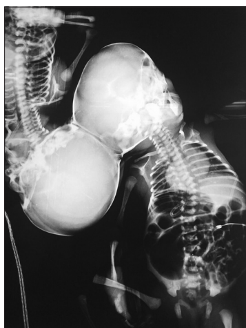
Figure 1: X-ray of craniopagus twins

A pair of female craniopagus conjoined twins aged 6 months admitted to pediatric surgery department for the purpose of separation surgery. This pair is a looking healthy. Their mother gave birth by cesarean section under spinal anesthesia, no perioperative complications. Before going for separation surgery, neurosurgeons planned for magnetic resonance imaging (MRI) head of the twins. Before taking the twins for MRI, evaluation done by taking thorough history, NPO status, and routine blood and urine analysis. Figure 1 shows X-ray of craniopagus twins.