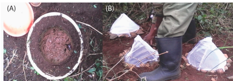
Figure 1. Experiment design: (A) a 1-L dung pat placed on top of a soil filled bucket and (B) pyramidal structures containing dung pats.