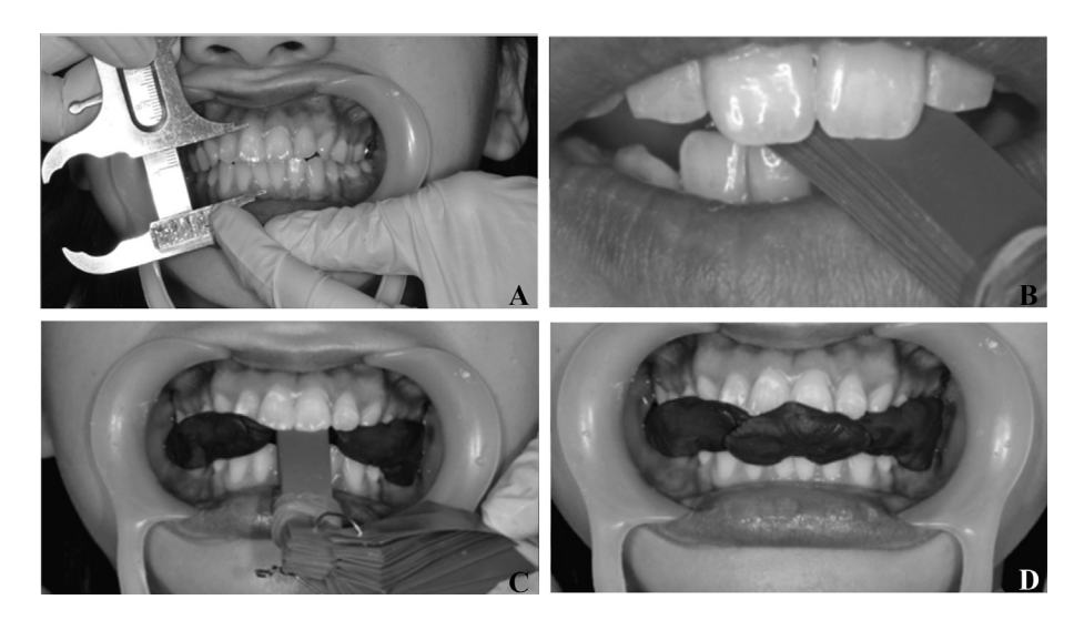
Fig. 1 Vertical dimension of occlusion (VDO) measurement. (A) The VDO was measured the distance between the zenith of the gingival contour of upper right central incisor and lower right central incisor in maximal intercuspation (B) Put the acrylic leaf gauge in the interocclusal space continuously to increase the VDO to 3 mm, 5 mm, and 8 mm (C) The dental impression brown compound was used to record the maxillao-mandibular relationship in the increasing VDO status (D) Fill the space of the acrylic leaf gauge with dental impression brown compound in the increasing VDO status.

performed to compare two different VDO increased group in lateral direction. SPSS for Windows statistical software package version 19.0 was operated for these aforementioned analyses. Statistical significance was defined as p < 0.05.