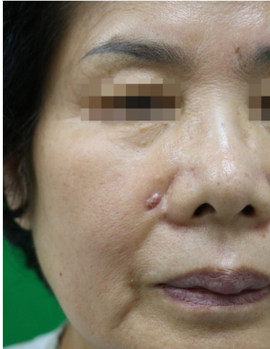
Fig. 1. A 74-year-old woman with a pinkish soft mass in her right cheek region.