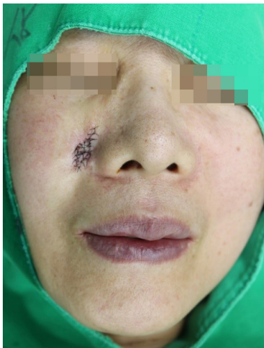
Fig. 2. Immediate postoperative photo showing complete elimination of the mass by the bilateral V-Y advancement flap.