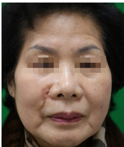
Fig. 7. Postoperative photo 3 months after extraction of the right maxillary canine tooth.

evaluation, irreversible pulpitis was observed on the right maxillary canine tooth. Therefore, the tooth was extracted and systemic antimicrobial therapy was started to suppress the odontogenic infection. The patient visited our clinic 2 weeks after the extraction, and no secretions from the cheek flap site were found and wound healing was complete. After 3 months, all odontogenic infections had resolved and no further recurrence was observed (Fig. 7). The extracted tooth was replaced with a dental implant.