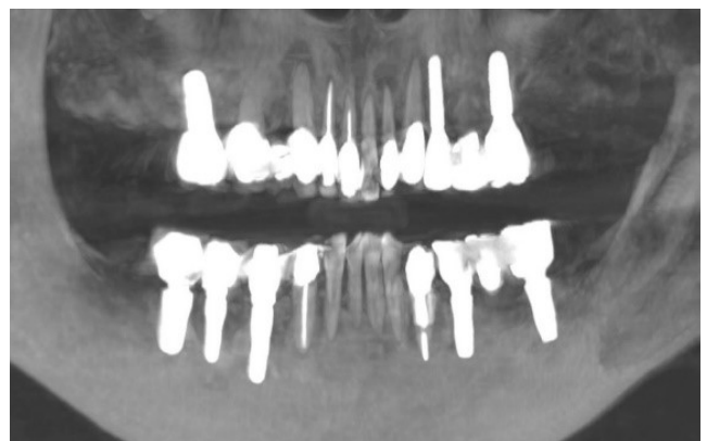
Fig. 5. Panoramic view of dental computed tomography images showing partial alveolar bone loss and periapical abscess formation in the right maxillary canine teeth.

In order to identify the cause of the recurrent PG, intraoral examination was repeated. There were no findings suggestive of odontogenic infection. Subsequently, panoramic X-ray and computed tomography (CT) were performed. The panoramic radiograph revealed partial alveolar bone loss due to pulpitis and the presence of a periapical abscess of the right maxillary canine tooth (Fig. 5). However, there were no findings suggestive of chronic osteomyelitis, such as soft tissue swelling, mucosal abscess, cutaneous abscess, and draining fistulas, on the CT images (Fig. 6). For evaluation of the odontogenic infection, the patient was referred to the dental department. During dental