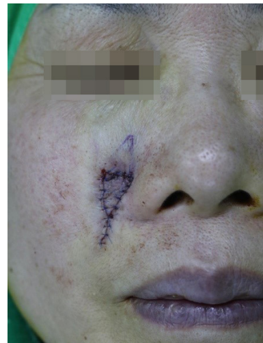
Fig. 4. Secondary postoperative photo showing coverage with a unilateral V-Y advancement flap.

tified. For histopathological examination, a tissue biopsy was performed and the results revealed chronic inflammation and abscess formation.