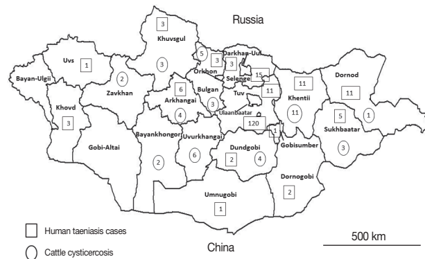
Fig. 1. A map of Mongolia showing the geographical origins of Taenia saginata detected from people and cattle. Numbers in open rectangle and open circle show human taeniasis cases and cattle cysticercosis, respectively.

worm carriers was extracted using the QIAamp DNA Stool Minikit after disruption of embryophores with glass beads [3]. The extracted DNA was kept at -20°C until further analysis could