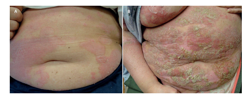
Fig. 3. Patient 16. Findings before and after treatment with secukinumab, etanercept, and ixekizumab. (A) Welldefined erythematous scaly plaques on the trunk, initially diagnosed as psoriasis, before biologic treatment. (B) Widespread plaques, some infiltrated, covered by yellowish thick scale-crusts on the trunk, after biologic treatment.

Most of the literature on MF and biologics focuses on anti-TNF- \alpha , and data on the effect of anti-IL-17 and/ or anti-IL-12/23 on MF are very limited (11-14). In the present cohort, of the 11 patients treated with anti-IL17 and/or anti-IL-12/23, or anti-IL-23, 8 patients, all with at least stage IB, showed stage progression under treatment. They included 5 patients in whom MF was initially misdiagnosed as another dermatosis (Table I). Likewise, in all 6 previously reported cases of MF under treatment with anti-IL-17 and/or anti-IL-12/23, the biologic/s were given for a cutaneous indication, and most of the patients were subsequently diagnosed with advanced-stage MF (11, 12, 14). Yoo et al. (11) described 2 patients with a long history of diagnosed psoriasis who were subsequently diagnosed with stage IB and stage IIIA MF after 12 and 8 weeks' treatment, respectively, with secukinumab (11). Others described patients with psoriasis/presumed psoriasis who were ultimately diagnosed with advanced-stage MF under treatment with etanercept