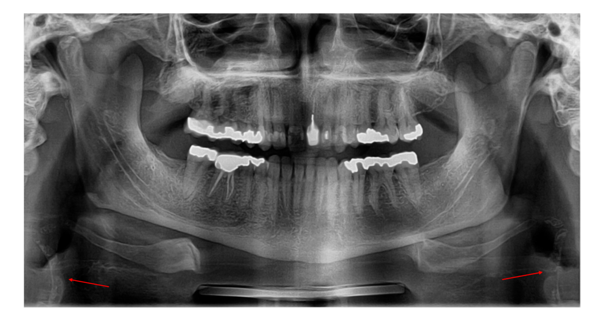
Figure 1. Bilateral carotid artery calcification.

With the absence of any radiologic exploration for CAC in Lebanon, the aim of this study was to assess this type of calcification in a Lebanese sample via panoramic radiography.