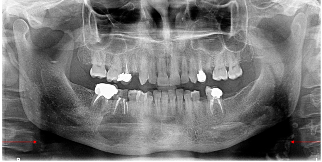
Figure 2. Panoramic image showing the presence of multiple small radiopaque entities inferior to the angle of the mandible at the level of C3–C4.