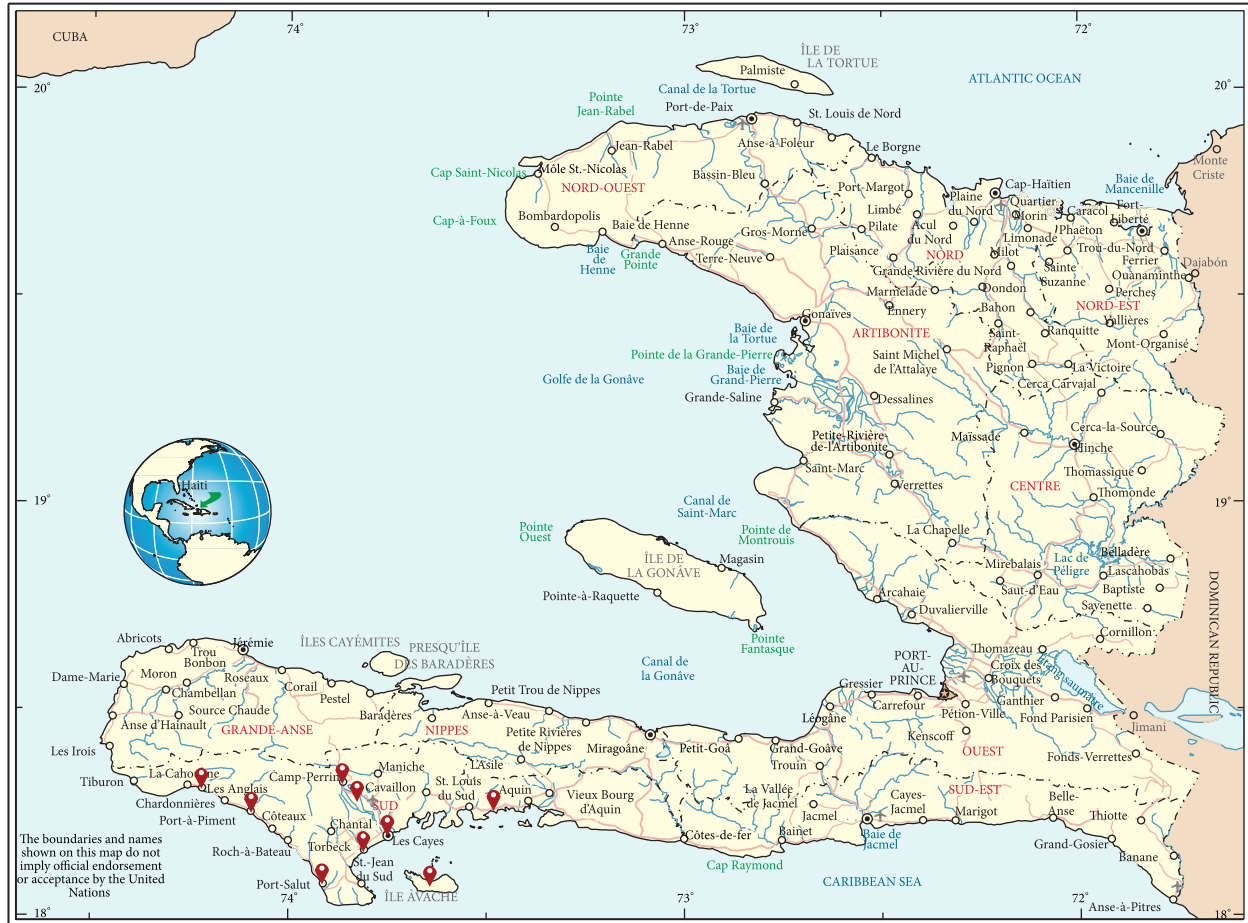
Map No.3855 Rev. 4 United Nations