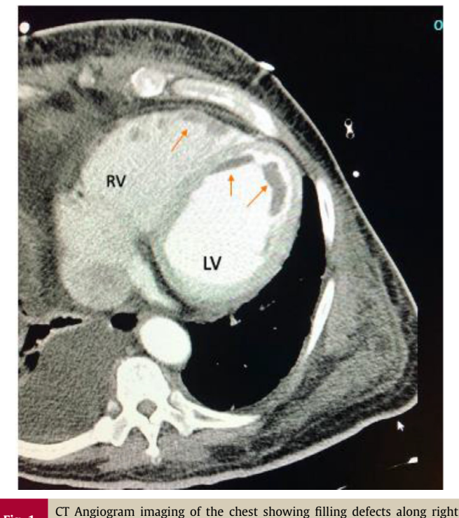
Fig. 1. Vertricle (RV) and left ventricle (LV) representing thrombus (arrows).

Initial SARS-CoV-2 PCR testing was negative in nasopharyngeal swab; however, given the strong suspicion of COVID-19 pneumonia, the patient remained isolated and transferred to the ICU in critical condition. He was started on antibiotics and anticoagula-