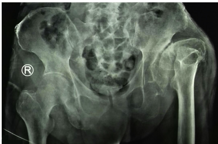
Fig. 1. Radiographic image of hip initial condition.