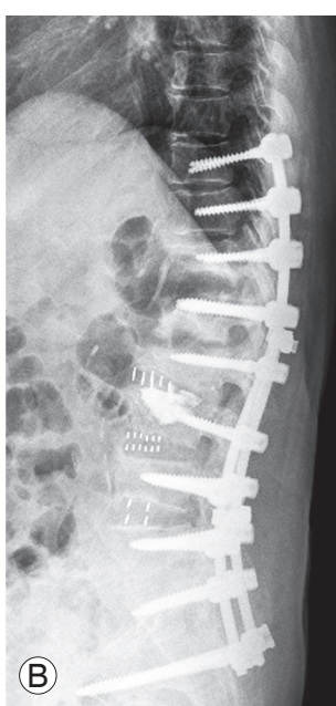
Fig. 1. Radiographs of a patient with proximal junctional kyphosis (PJK). Preoperative lateral radiograph of a 77-year-old woman with PJK showing proximal junction angle of 17.5° (A). Postoperative 3-month follow-up lateral radiograph after revision surgery from T10 to the sacrum (B).

of PJK [4-6]. Reflecting these factors, Helgeson et al. [12] proposed another definition for PJK, which specifies a proximal junctional angle (PJA) at least 15° from the caudal endplate of the UIV to the cephalad endplate of one or two vertebrae above the UIV. After a large, multicenter retrospective study of patients with ASD, Hostin et al. [13] defined PJK as a Cobb angle formed by the lower endplate of the UIV and the upper endplate of two supra-adjacent vertebrae of 15° or greater above the UIV. O'Shaughnessy et al. [14] and Bridwell et al. [15] used 20° as their cutoff value, given that this was the angle associated with poorer patient-reported outcomes among patients who underwent primary adult scoliosis surgery. Although a cutoff value of 15° or 20° could reflect the physiological factors and clinical outcomes for PJK, these values are too narrow to be the standard for PJK revision surgery [16]. Although a cutoff value of 10° could be applied in PJK, the final decision by spinal specialists should take into account the scale of the revision surgery, the radiological development, and the clinical outcomes.