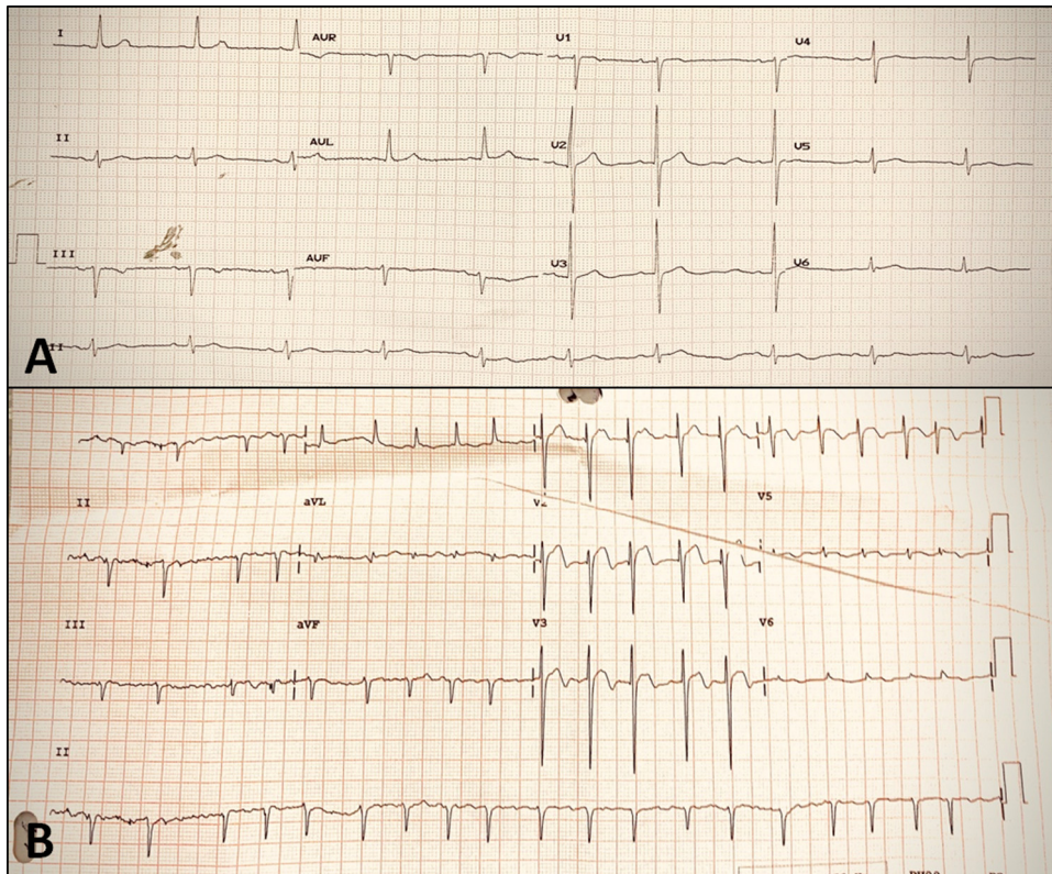
Figure 1 Baseline and follow-up electrocardiograms. (A) Baseline electrocardiogram with sinus rhythm and no ischemic or necrotic changes; (B) electrocardiogram during chest pain on the fifth day of hospitalization, showing atrial fibrillation and ST-segment elevation in leads V1-V4.