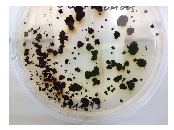
Figure 1. Growth of Cryomyces antarcticus on agar plate. doi:10.1371/journal.pone.0109908.g001