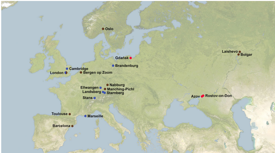
Figure 1. Location of ancient samples from victims of the second and third plague epidemics. Red dots highlight the locations of the samples from our study: Rostov-on-Don, Russia (Rostov2033 and Rostov2039, 1762–1773 AD), Azov (Azov38, fifteenth to seventeenth century AD) and Gdańsk (Gdansk8, 1425–1469 AD). Brown dots represent locations of previously published Y. pestis samples closer to the Black Death period (thirteenth to fourteenth century, [12,20,27,28]). Blue dots represent locations of previously published Y. pestis samples dated to the post-Black Death period (fifteenth to eighteenth century, [12,18,20,27]). (Online version in colour.)

a historical relic, plague is still a viable threat with worldwide outbreaks [4–6]. Since 2000, more than twenty outbreaks have been documented across the world; the last severe one in 2017 occurred in Madagascar [4,6]. Natural reservoirs of plague infection are present in Central, Eastern and Southern Africa, South America, the western part of North America and in large areas of Asia. These reservoirs are considered the main reason for the impossibility of plague eradication [5], and include ground squirrels, rabbits, hares and other animals [2,3]. Additionally, peri-domestic animals are often a source of infection for humans via fleas living on infected rats or via direct contact with wild or other peri-domestic animals [2,3].