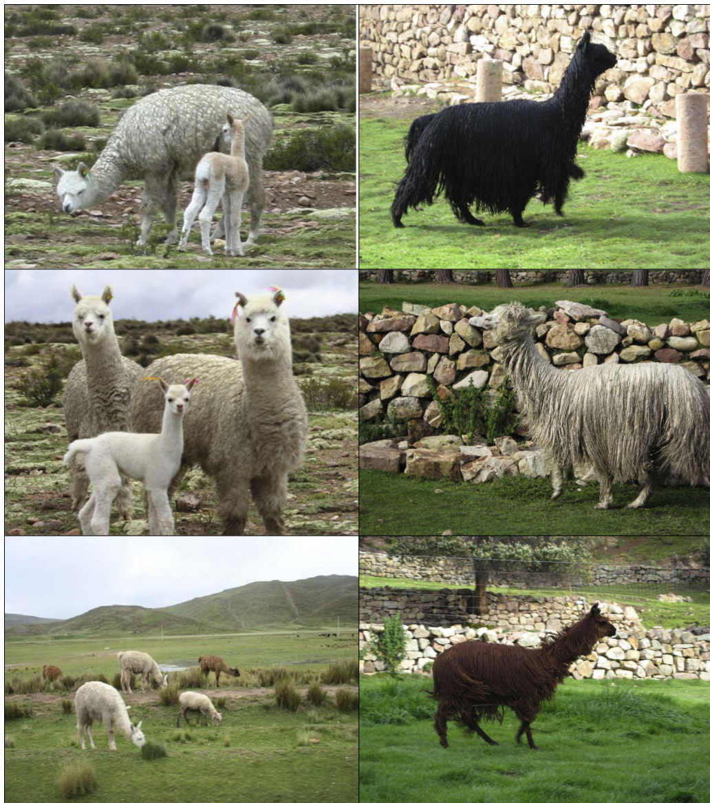
Figure 2 Huacaya and Suri phenotypes. The left column show some usual Huacaya alpacas; the right column show three magnificent Suri champions.

moderately linked, the double heterozygous (Suri) animals will produce recessive gametes (“Huacaya haplotypes”) at two different ratios, depending on the cis/trans configuration of their diplotype. When both recessive alleles are in cis, a Huacaya haplotype will be transmitted with 50% chance minus the recombination rate (which restores a Suri haplotype); when the recessive alleles are in trans, only recombination may produce Huacaya haplotypes, so that their transmission has a probability much lower than 50%. The estimated recombination fraction was about 10%, although this estimate is rather speculative given the low number of informative meioses, so that the confidence interval was rather large (3% to 20%).