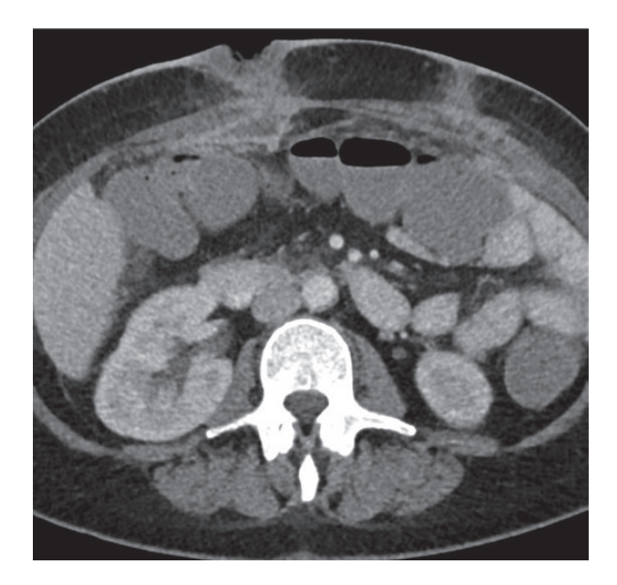
Figure 2. Computed tomography of the abdomen at diagnosis, April 21, 2015, demonstrating abdominal wall collections deep to laparoscopic port sites.

case series of RGM gastric band infections reported on the time period 2005-2011, 11 cases were due to Mycobacterium fortuitum and 7 were due to M. abscessus. Although the time from band placement to infection ranged from 21 days to 8 years, the majority presented within 3 months, manifested by peritonitis, band erosion, or chronic ulceration at the port site. The port was considered the primary location of infection in 10 patients (56%) [5]. We cannot be sure when infection of the gastric band occurred in our patient; however, it is possible that it occurred at insertion in 2008, remaining latent until the immunocompromise incurred 7 years later from AML and chemotherapy. We did not perform hospital environmental sampling for M. abscessus culture, but we believe that hospital-acquired infection is unlikely, as there were no other contemporaneous M. abscessus cases identified, nor any prior or subsequent M. abscessus cases related to the hospital environment or water supply.