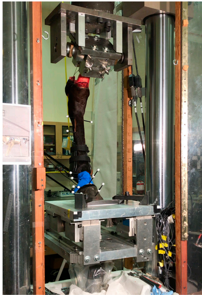
Figure 1. Cadaveric limbs were transected at the middle of the tibia and mounted proximally in a material testing system. The distal steel platform allowed for craniocaudal translation during limb loading. Motion capture markers were mounted to bone fixed pins in the third metatarsal bone, first and second phalanges, as well as the hoof.

Distally within the MTS, the hoof was placed directly onto a steel platform that was able to translate cranially and caudally during limb loading. A toe block was mounted in front of the hoof to prevent translation of the hoof relative to the platform. Initial compressive loading was controlled manually (i.e., not controlled by computer) up to 1800 N. Each limb was then preconditioned for 200 cycles at 0.25 Hz from approximately 500 N to 1800 N (displacement controlled by computer, \Delta d unique to each limb). After this preconditioning, each third metatarsal bone maintained a vertical orientation under all loads greater than 500 N. Compressive loading was then manually increased to 3300 N (approximate peak load at walk).