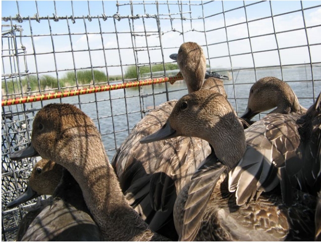
FIGURE 2 Age ratios of female northern pintails captured for banding could provide estimates of population-level fecundity, but estimates should be corrected for potential differential vulnerability to capture.

and adults banded between 1955 and 2013, but only 121 and 68 dead recoveries and 45 and 15 live encounters during the initial banding season.