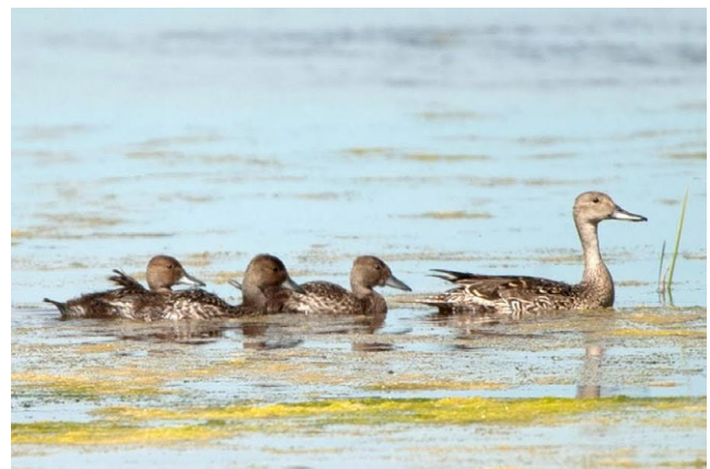
FIGURE 1 A female northern pintail ( Anas acuta ) with three nearly fledged ducklings.

My objectives in this study are to develop and apply population projection models including fecundity, juvenile survival, and adult survival derived solely from tagging data (i.e., age-specific counts of numbers of birds banded during postbreeding capture occasions, recaptured alive during the same season as originally marked or subsequently found dead any time after marking). I apply these models to two species of North American birds. Northern pintails ( Anas acuta ; Figure 1) have experienced a prolonged population decline and previous studies have shown it cannot be explained by declining survival (Bartzen & Dufour, 2017), suggesting that lowered fecundity may be the cause (Specht & Arnold, 2018), but to date there have been no integrated analyses for pintails to identify relative contributions of different vital rates to observed population changes (Koons, Arnold, & Schaub, 2017). Dark-eyed juncos ( Junco hyemalis ) are a widespread passerine that has been well-studied at several localized and primarily southern breeding sites (Nolan et al., 2002), but most of their breeding range occurs in remote portions of the boreal forest that lie well north of established monitoring programs (Saracco, DeSante, & Kaschube, 2008; Sauer & Link, 2011). However, they are well sampled by migrant banding stations (Leppold & Mulvihill, 2011), so an