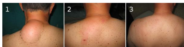
Figure 2: Preoperative (1), early postoperative (2) and late postoperative findings (3) at the same patient with lipoma on the upper dorsal region treated with liposuction

Photo documentation of two cases is shown in Figure 1 and 2.