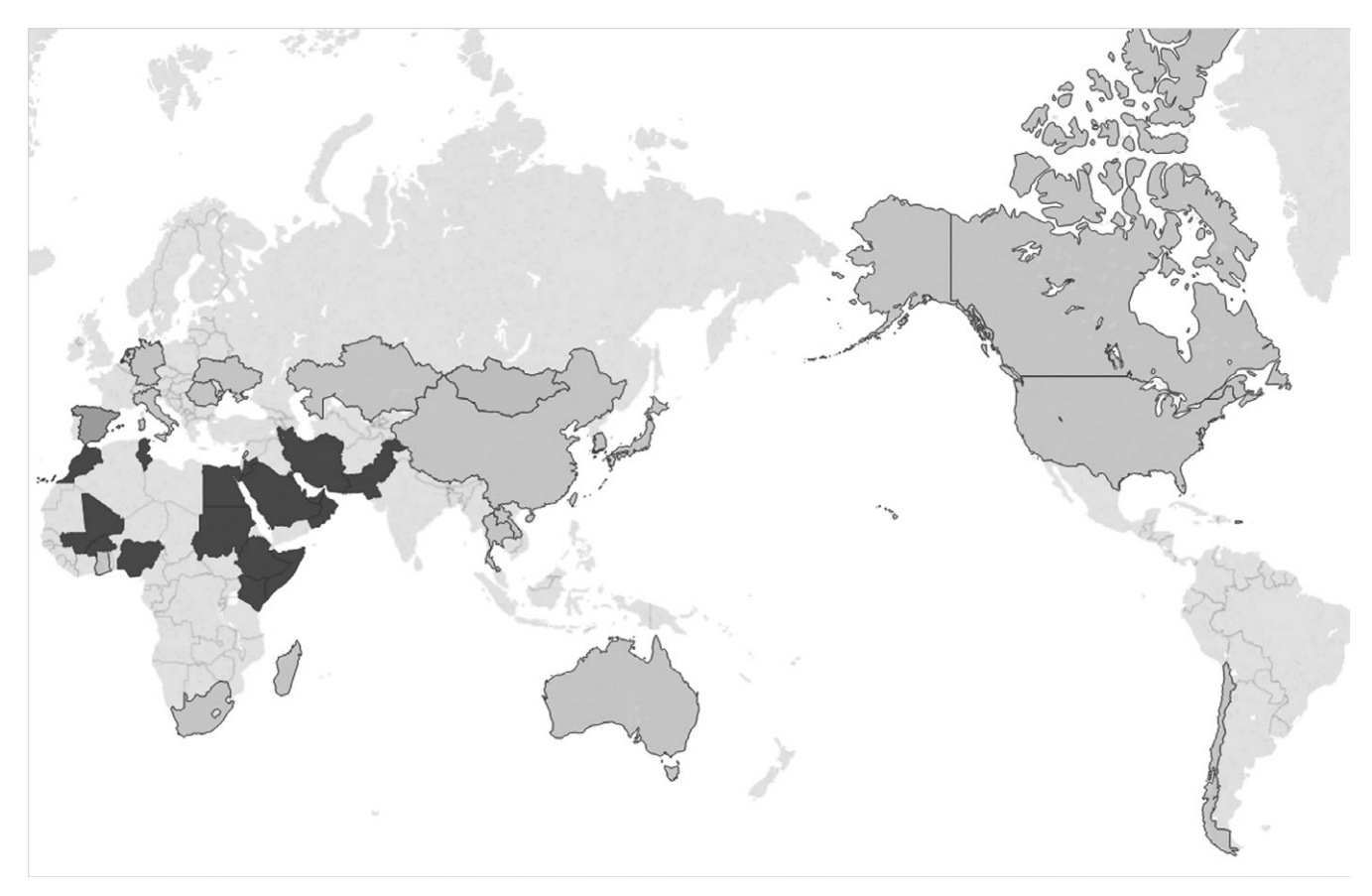
FIGURE 2 Countries with reported MERS-CoV exposure or infection in animals, based on publications included in this scoping review. Countries with light shading indicate where samples were collected, but none tested positive to MERS-CoV. Countries with dark shading indicate where samples collected from animals in at least one study tested positive to MERS-CoV either by antigenic or antibody testing

All experimental studies that involved livestock included in their methodology the testing of animals prior to challenge or vaccination. Two studies that used purpose-bred white mice did not report testing the animals for MERS-CoV prior to intervention. The duration of experimental studies ranged from 24 to 84 days after the first intervention (pathogen or vaccine inoculation), and six out of nine studies reported sampling subjects for greater than one month. One study used positive controls, while four studies used negative control subjects (none reported both types of controls).