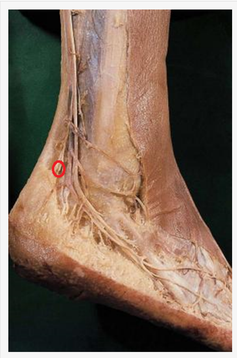
Fig. 3. Sural nerve in cadaver specimen in its constant location. BLUE dot signifies area to palpate against calcaneal wall.