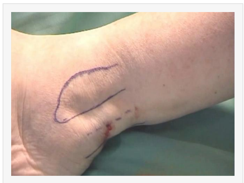
Fig. 5. Sural area for injection behind lateral malleolus.