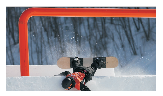
Fig. 1. Snowboarding injury scene of an athlete who had shoulder dislocation. Adapted from Yonhap News.<sup>8)</sup>

Three patients required surgery: one patient with humerus fracture underwent surgery at the Olympic hospital and the others patients (shoulder dislocation with Bankart lesion or AC-CC injury) returned to their home country for surgery. Patients who did not need surgery were prescribed analgesics and underwent conservative management. Patients with AC-CC injury or shoulder dis-