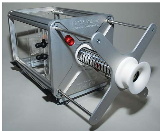
► Fig. 2 The Boškoski-Costamagna ERCP Trainer.