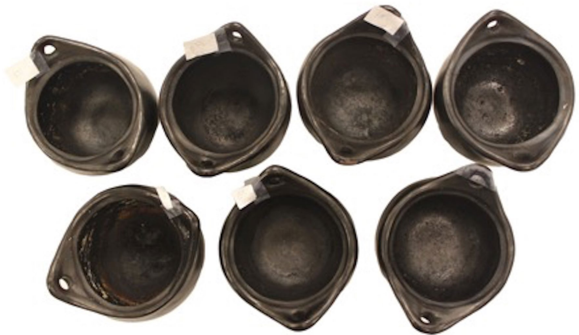
Figure 1. Unglazed “La Chamba” pottery used for each cooking experiment; photo taken after the final cooking event (carbonized organic patina residue and charred macro-remains are visible inside the pots).