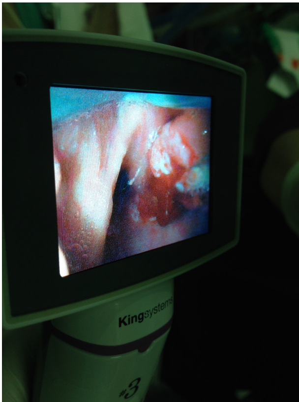
Figure 1 Picture of visualization of the tumor obscuring the entrance to the larynx using the KingVision™ video laryngoscope (King Systems, Noblesville, IN, USA).

A size 7.0 endotracheal tube was then introduced into the trachea. General anesthesia was commenced with propofol infusion and maintained with sevoflurane and rocuronium. The surgery and perioperative period were uneventful.