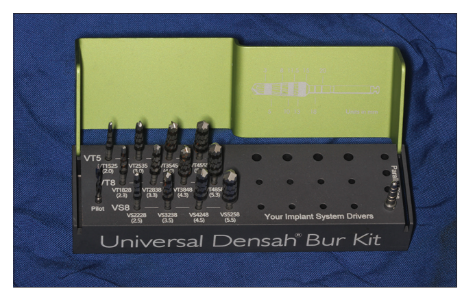
Figure 1: Versah Kit with densification drills

A systematic review was undertaken to analyze if OD procedure had any advantages over conventional osteotomy on bone density and primary stability. An electronic database search was conducted in PUBMED using keywords such asOD, implant primary stability,