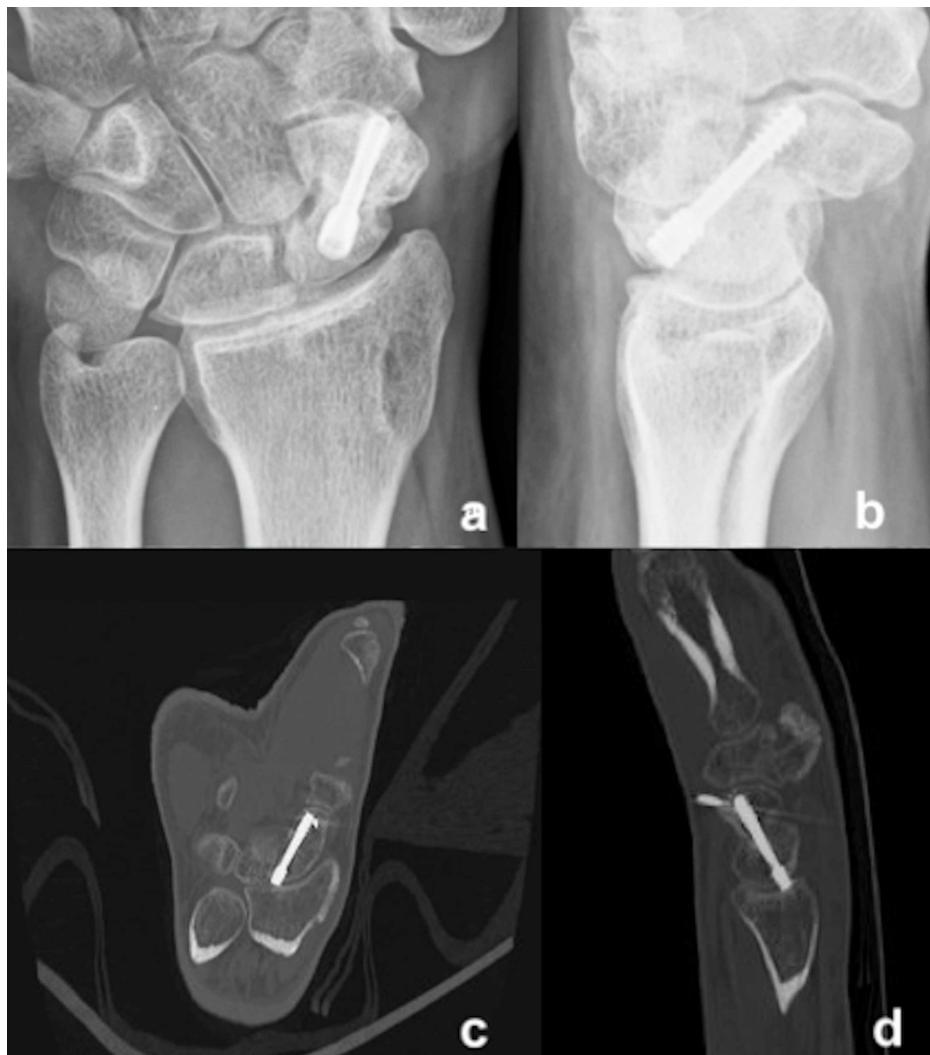
FIGURE 3: Posteroanterior (a) and lateral (b) radiographs showing good union at weeks after the surgery, CT scan (c, d) shows good union with vascularized bone graft incorporation at the nonunion site

One patient had Kirschner wire irritation, which settled later with pin removal (Table 2).