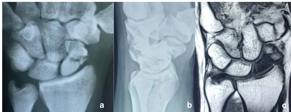
FIGURE 1: Posteroanterior (a) and lateral radiographs (b) of a 29-year-old man with left side scaphoid nonunion and avascular necrosis of 36 months duration. MRI (c) showing scaphoid nonunion with a T1-weighted coronal image showing diffusely decreased signal within the proximal pole

Plain radiographs (posteroanterior, lateral, and oblique wrist views, and a posteroanterior ulnar deviation view) with sclerosis, fragmentation, and collapse confirmed the diagnosis. Computed tomography (CT) scans effectively confirmed the collapse with nonunion bone characteristics such as resorptive changes, sclerosis, joint space narrowing, and fragmentation. Magnetic resonance imaging (MRI) with low-signal intensity on T1-weighted sequences, lack of contrast enhancement, and homogeneously decreased signal on T2-weighted fat-suppressed images confirmed the avascular necrosis of the proximal pole of the scaphoid (Figure 1).