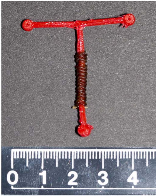
FIGURE 1 Printed implant from Experiment 2. A 30-throw Chinese finger trap suture pattern of #1 catgut has been placed on the vertical portion to enhance urolith adherence

with #1 catgut (Catgut Chrom, B Braun Aesculap, Center Valley, Pennsylvania, 18034) suture placed in a 30-throw Chinese finger trap suture pattern on the shaft (Figure 1). In both experiments, the prepared implants were weighed and stored in isopropyl alcohol before implantation.