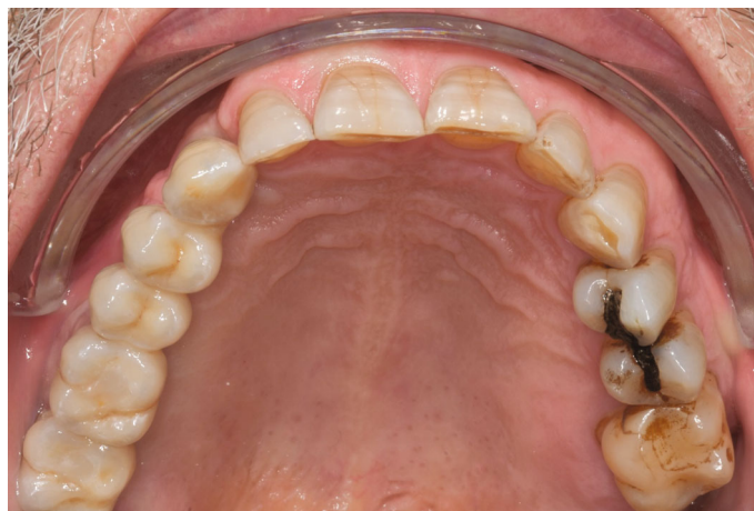
FIGURE 4: Occlusal view of the restoration after the placement.