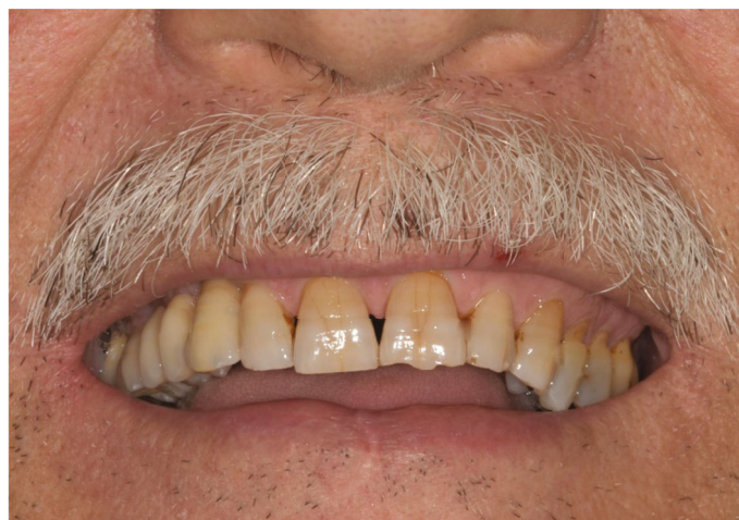
FIGURE 5: Extraoral view at the 3-year follow-up.

Full-contoured prostheses were made of acrylic resin and tried in intraorally.