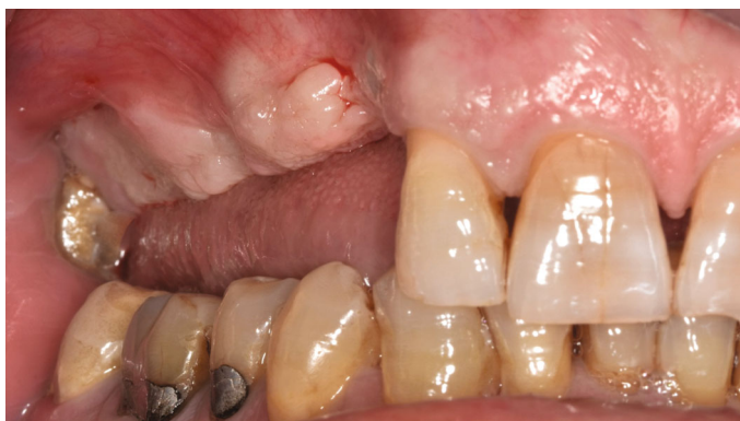
FIGURE 2: Initial situation before the implant placement.