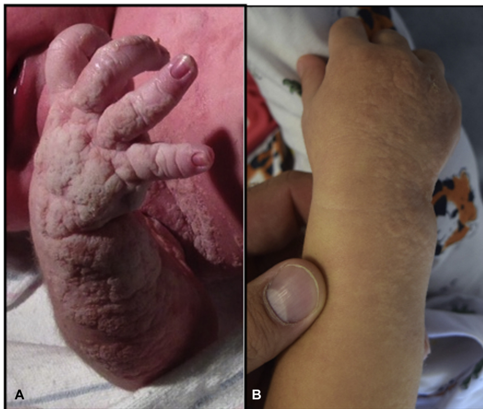
Fig 1. A , PEODDN. Patient 1: stippled verrucous papules in a blaschkoid distribution over the hand and forearm seen at birth. B , Patient 1: Marked decrease in linear papules and plaques seen at 15 months of age.

improvement, with thin, less than 1-mm papules scattered over the right forearm.